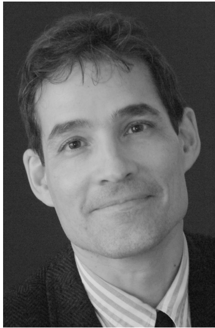
George A. Bonanno

experience subthreshold symptom levels. Resilient individuals, by contrast, may experience transient perturbations in normal functioning (e.g., several weeks of sporadic preoccupation or restless sleep) but generally exhibit a stable trajectory of healthy functioning across time, as well as the capacity for generative experiences and positive emotions (Bonanno, Papa, & O'Neill, 2001). The prototypical resilience and recovery trajectories, as well as chronic and delayed disruptions in functioning, are illustrated in Figure 1.